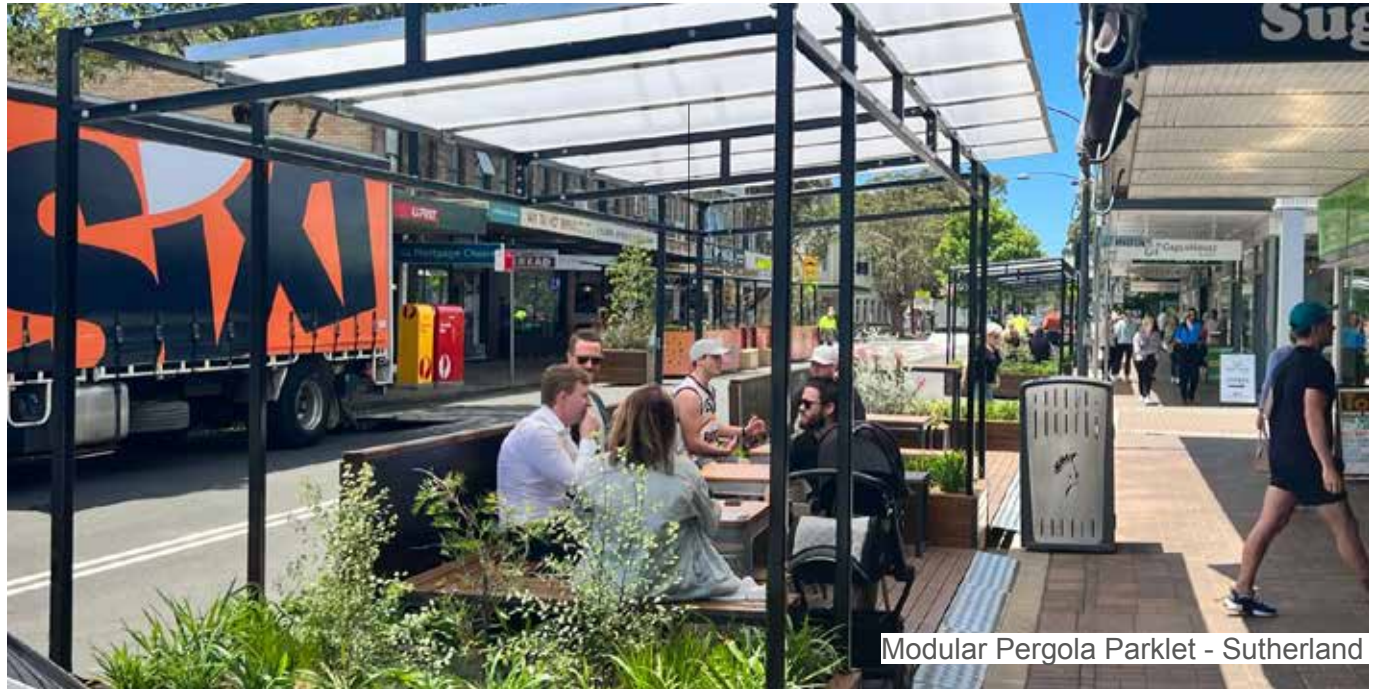
Modular Pergola Parklet - Sutherland

We have a range of products that are designed for road and cafe parklets. All engineered for heavy wear and tear, low maintenance, stormwater flow and pedestrian safety.