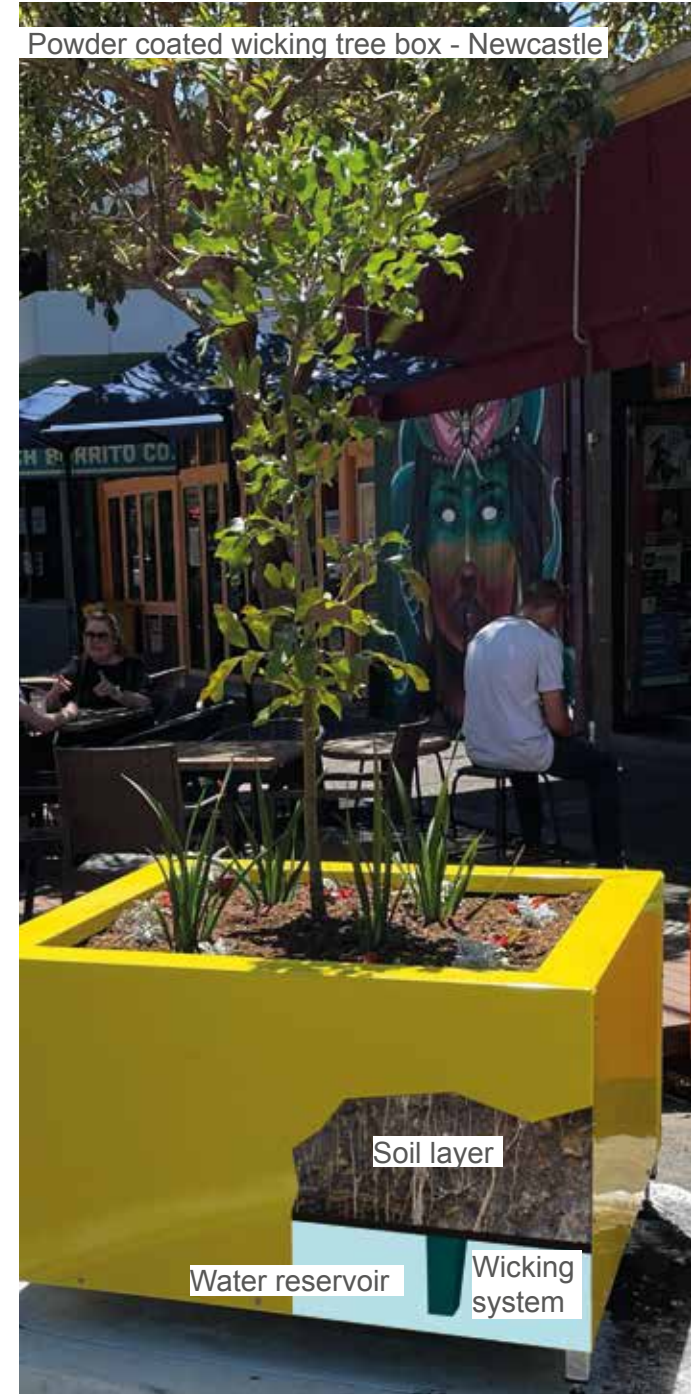
Powder coated wicking tree box - Newcastle