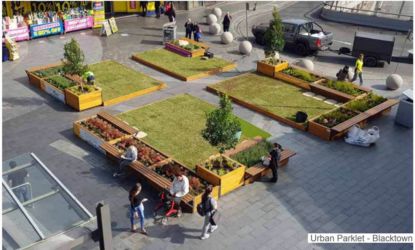
Urban Parklet - Blacktown

Our free standing Parklets require no excavation or surface preparation. All planters and garden trays have internal wicking systems that capture rainwater and minimise water maintenance. Seating, tables and canopy options.