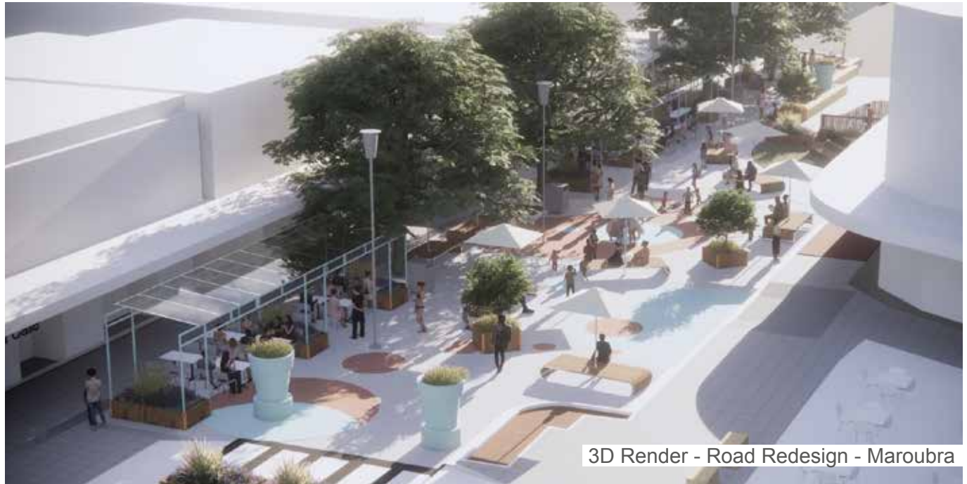
3D Render - Road Redesign - Maroubra

In essence, good design is a multi-faceted process that involves creativity, empathy, collaboration, and a deep understanding of the users and their needs. It has the power to shape our environment and contribute significantly to the well-being and happiness of individuals and communities.