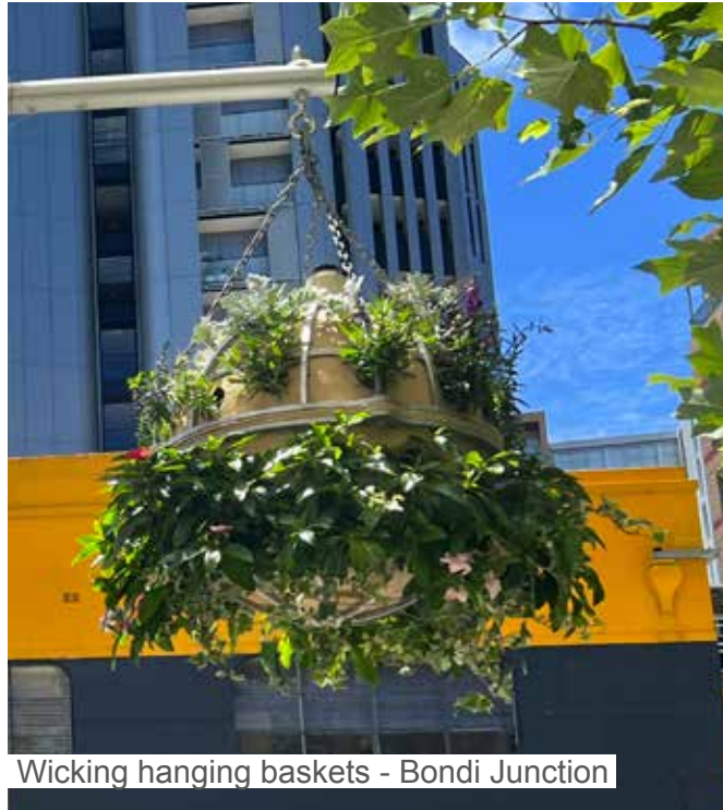
Wicking hanging baskets - Bondi Junction

All our green infrastructure have a built in wicking system that supplies water to the plants, when they need it, from the internal water reservoir. This greatly improves plant health and reduces maintenance.