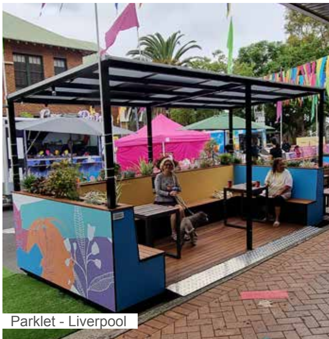
Parklet - Liverpool