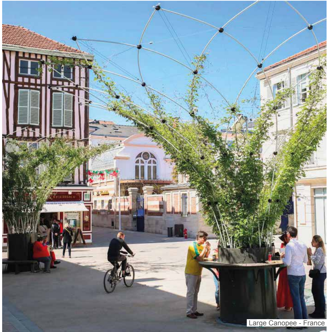
Large Canopee - France