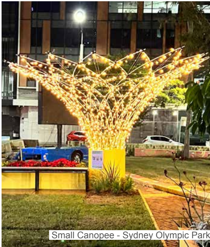
Small Canopee - Sydney Olympic Park

Introducing the Canopee to bring shade, cooling, well being and biodiversity habitat where trees can not be planted. A lightweight, self contained, bio-inspired designed that acts as a vine trellis. Comes in different sizes with solar lighting, built in water reservoir and smart irrigation system for ease of installation and maintenance.