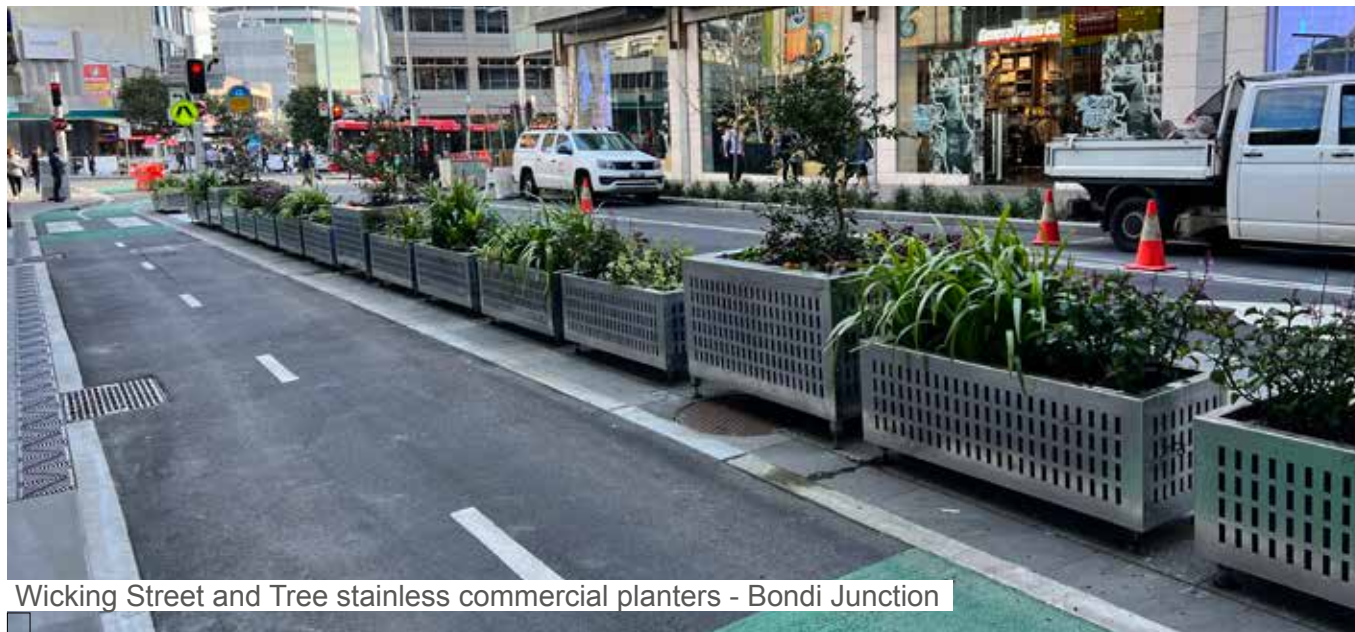
Wicking Street and Tree stainless commercial planters - Bondi Junction