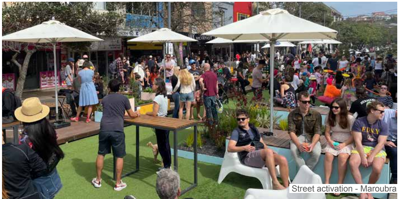
Street activation - Maroubra