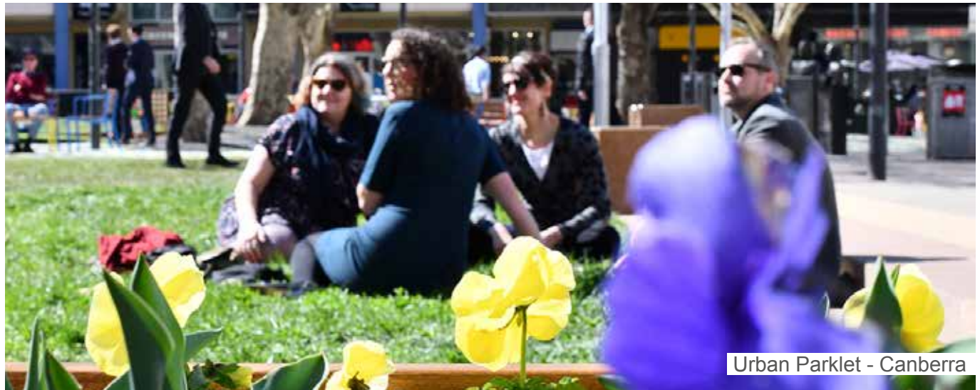
Urban Parklet - Canberra